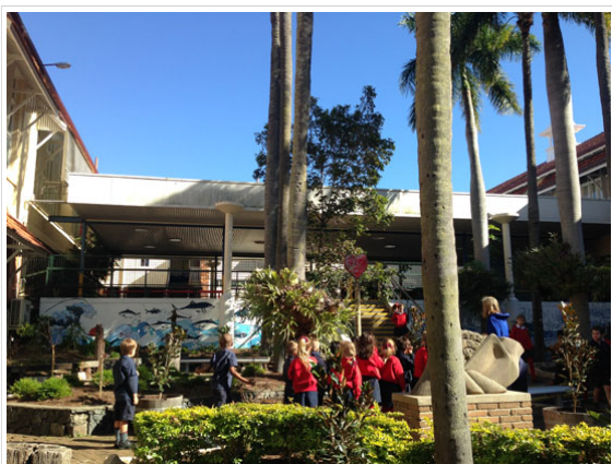
Prep B tour our new additions to the sculpture garden on Monday

A very warm welcome back this week - we need it as it's going to be cold! Please remember to keep our kids warm - hopefully avoiding colds and flu.